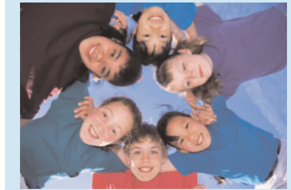
Children who are ready are more likely to start school successful, and stay successful.

In Vermont, many children are well-prepared for school, but many are not. School readiness is made up of many dimensions—social and emotional development along with basic knowledge and understanding, for example, as well as good physical health. Language